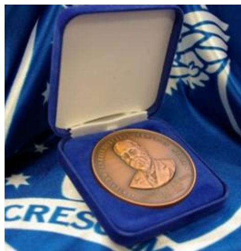
The Kernot Memorial Medal

The award consists of a medal and a certificate in recognition of the recipient's distinguished engineering achievement in Australia .